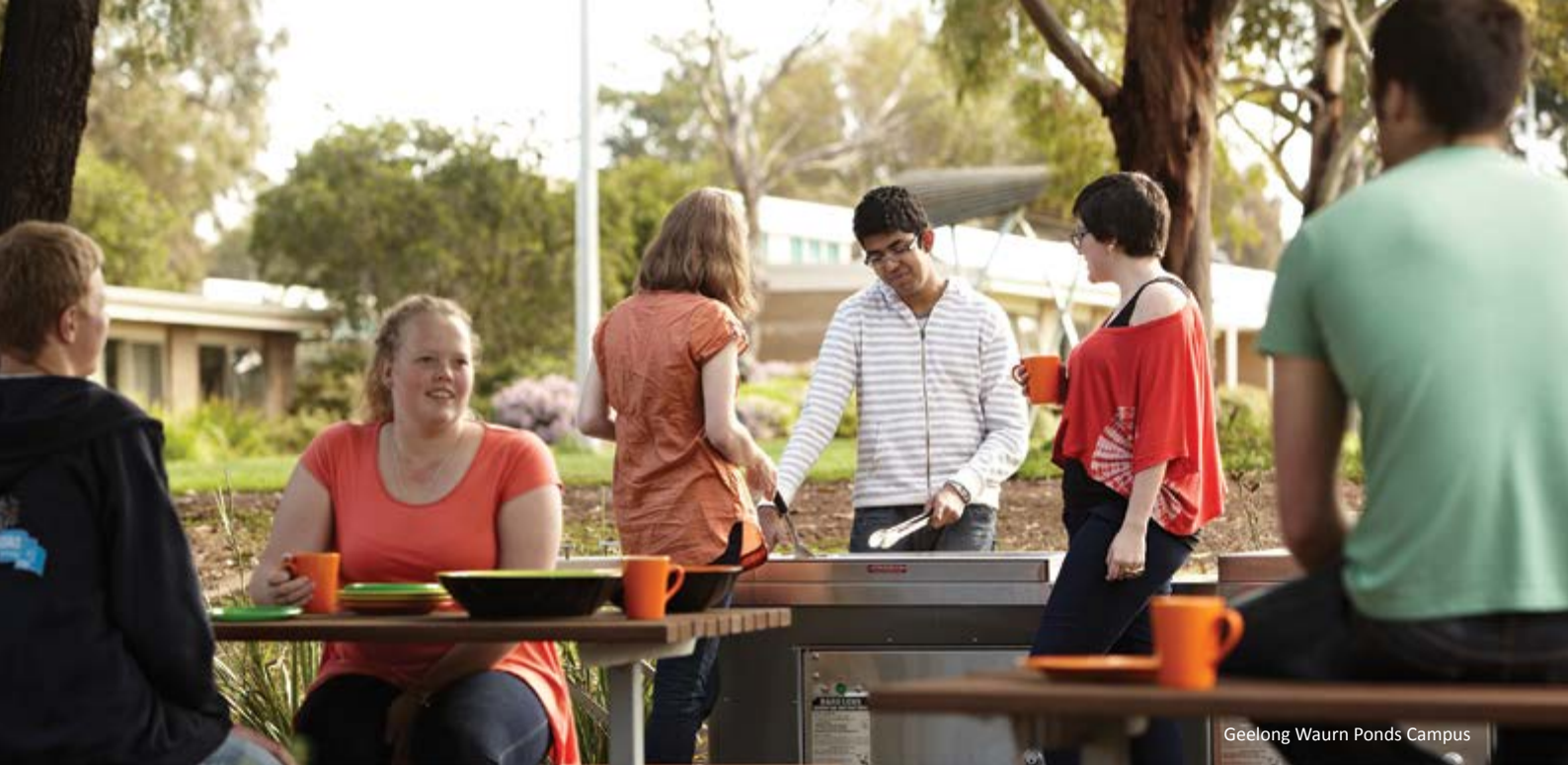
Geelong Waurn Ponds Campus