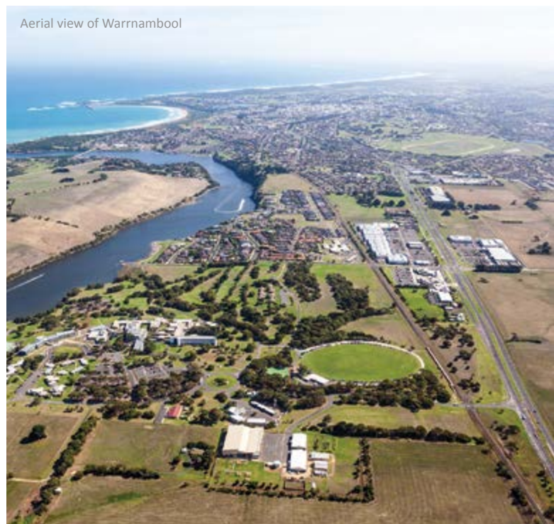
Aerial view of Warrnambool