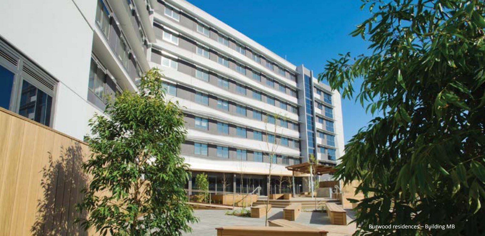
Burwood residences – Building MB