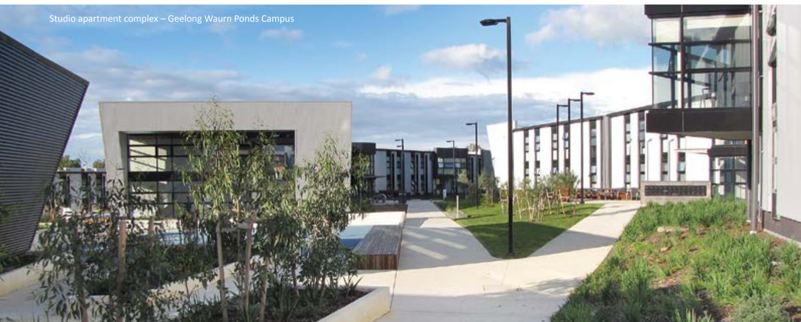
Studio apartment complex – Geelong Waurn Ponds Campus

Our 10 medical accommodation pods each house three students. They comprise individual architecturally-designed units offering superb living and study facilities.