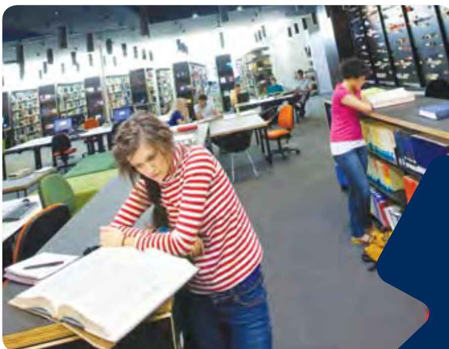
Melbourne Burwood Campus Library

Deakin's Practical Legal Skills (PLS) program is a unique and extremely beneficial inclusion for our Bachelor of Laws degree. The program enhances your understanding of alternative dispute resolution through participation in a variety of tasks. The PLS program is an extremely valuable way to develop research and critical thinking skills, and the ability to present arguments orally and in writing, with some of these tasks undertaken in the Magistrates and County Courts. The PLS program requires the completion of four dispute resolution units – Moot, Mediation, Arbitration and Witness Examination. They are core requirements of the Bachelor of Laws degree and are normally undertaken as one unit in each year of your degree.