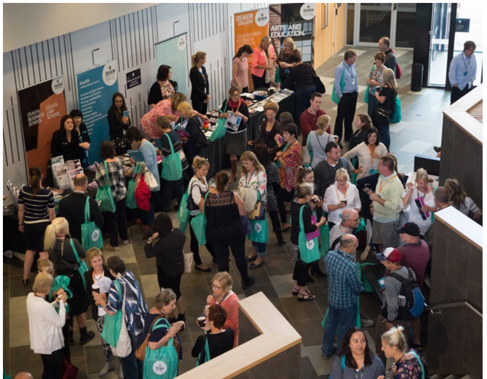
2017 Deakin University Careers Practitioners' Seminar (Geelong Waurn Ponds Campus). Please see over the page for the event wrap up.