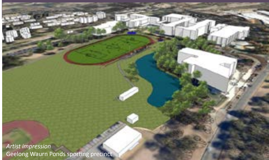
Artist impression Geelong Waurrn Ponds sporting precinct

Transport will be provided for those who need it. Stay tuned for more information.