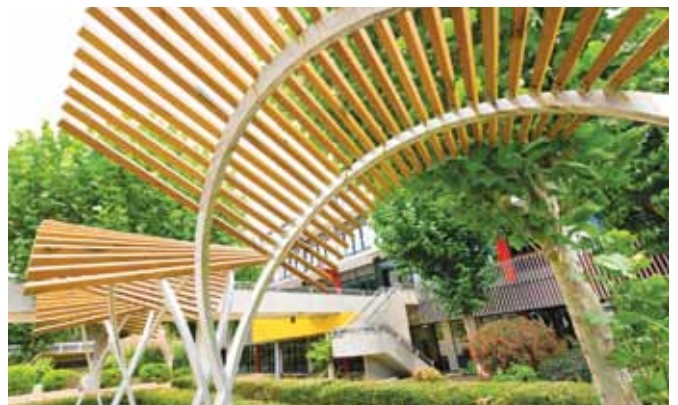
Geelong Waurm Ponds Campus