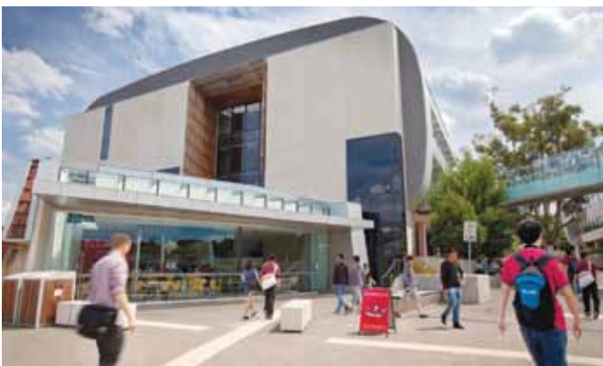
Melbourne Burwood Campus

This is Deakin's newest campus, located on Corio Bay, in the central business district of Geelong. Originally built in 1893, the buildings have been extensively renovated to create a modern and impressive campus centre. More than 2300 students are based here.