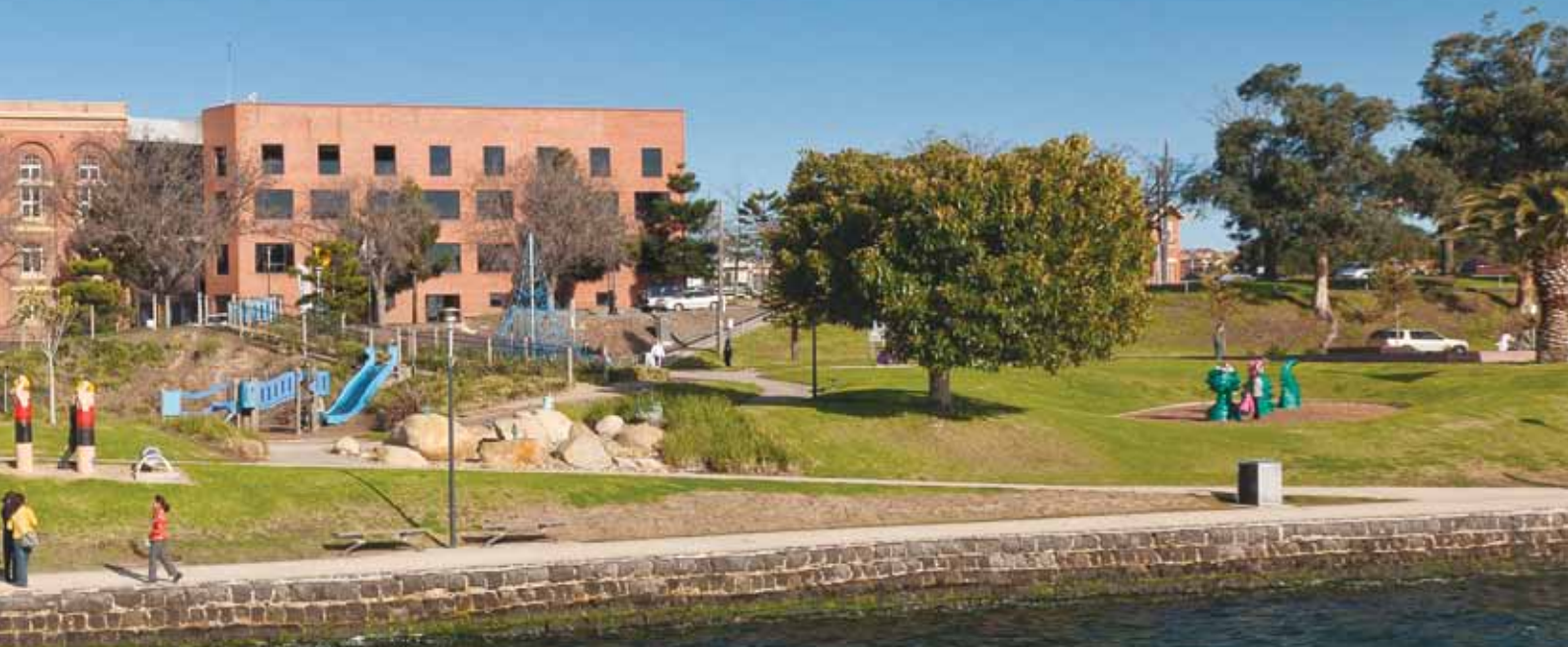
Geelong Waterfront Campus