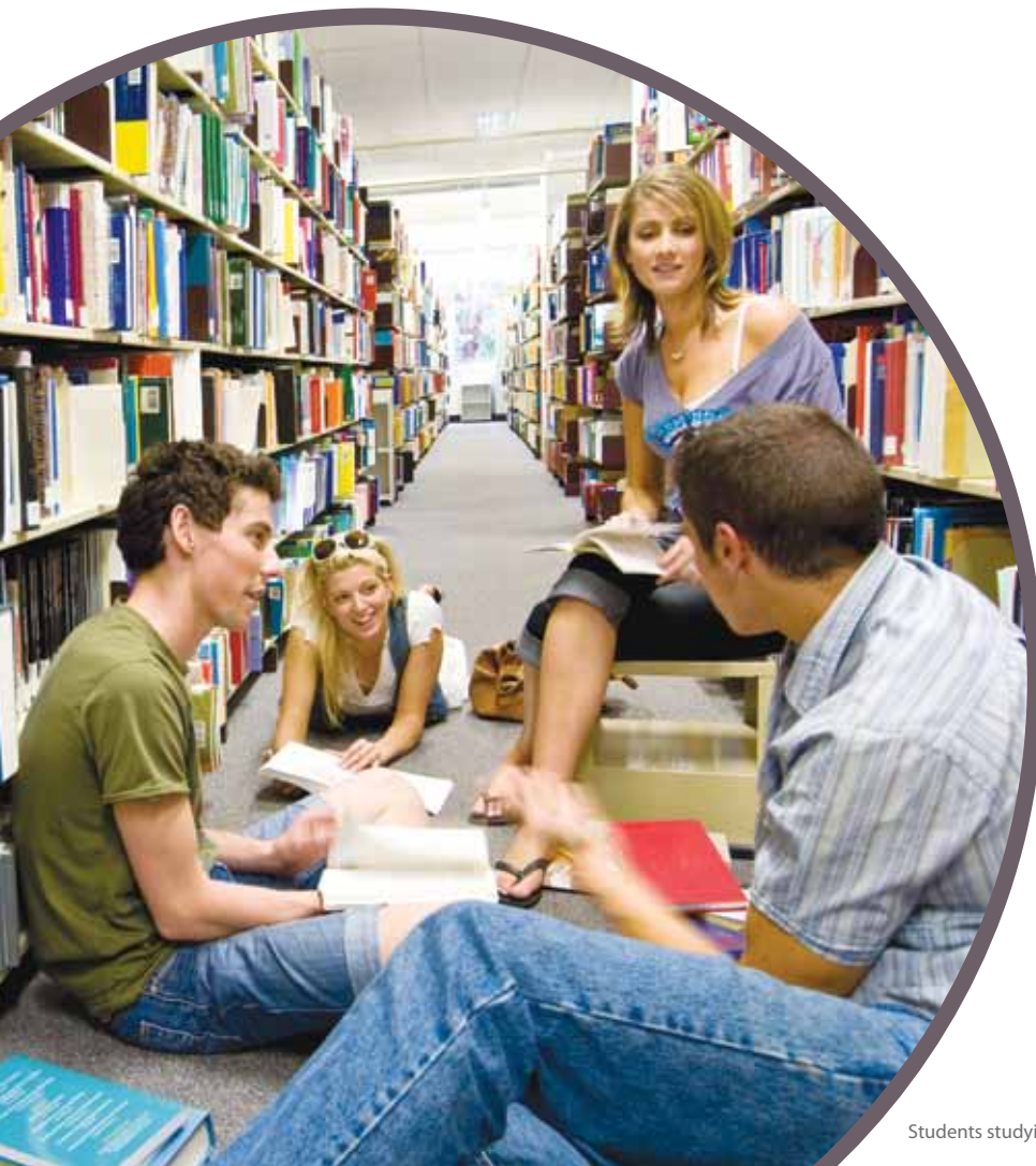
Students studying in the Library at Melbourne Burwood Campus.

For more information regarding research degree applications to Deakin, please visit deakin.edu.au/research .