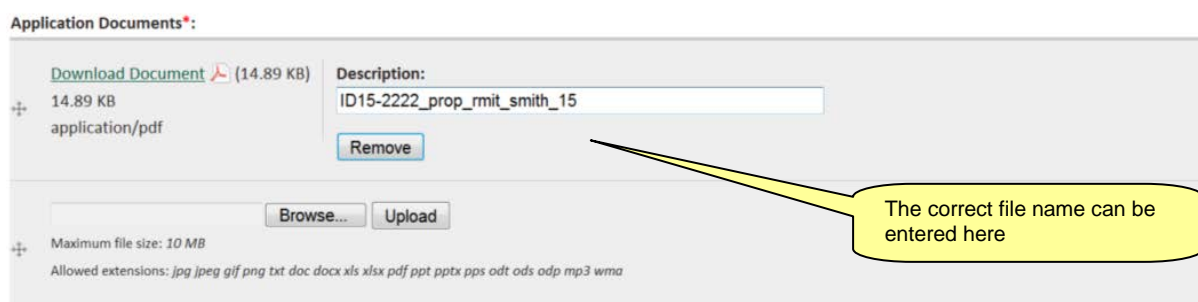
Figure 6: How to name attachments

Moving between pages, printing and amending fields may cause attached files to drop out. Please check that files are attached before saving to draft or submitting.