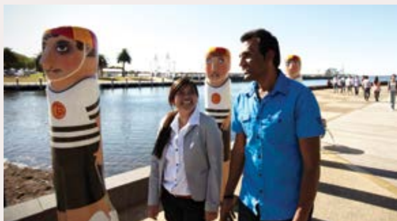
DUELI students enjoying the Geelong Waterfront precinct opposite the campus building.