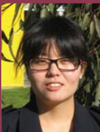
Country of origin: China

‘I started my Australian journey at DUELI in Geelong and it was sensational. Not only did I improve my English skills but I also made lifetime friends and came in contact with the wonderful Australian culture. I have now finished my studies at both DUELI and Deakin but I still enjoy going to conversation class every Monday!’