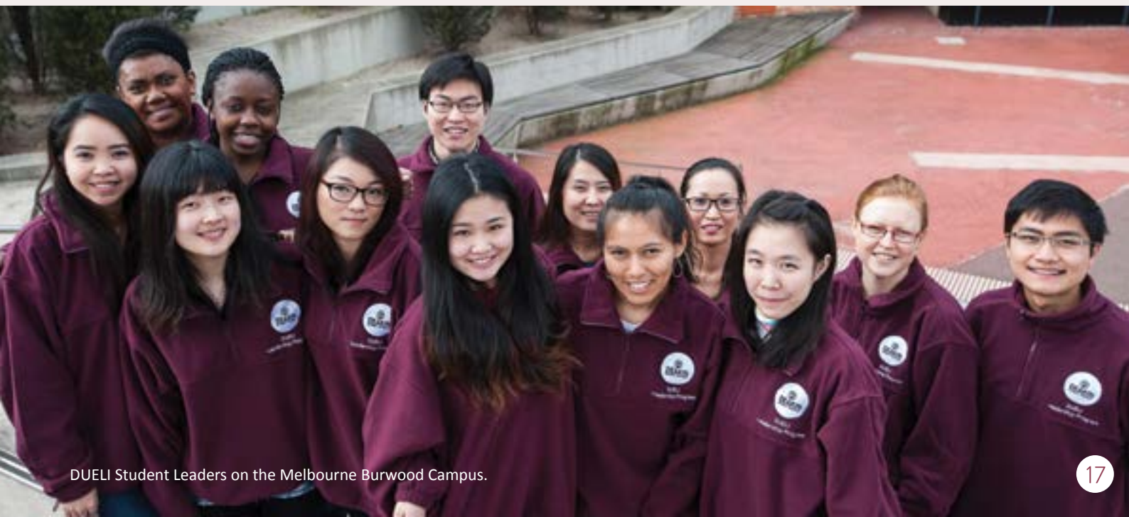
DUELI Student Leaders on the Melbourne Burwood Campus.