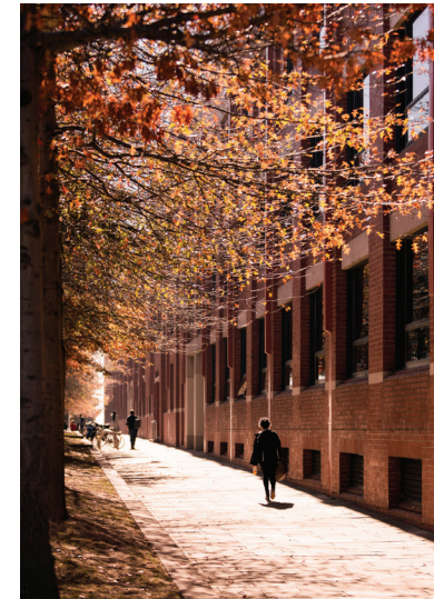
1 Gheringhap Street Geelong Victoria 3220