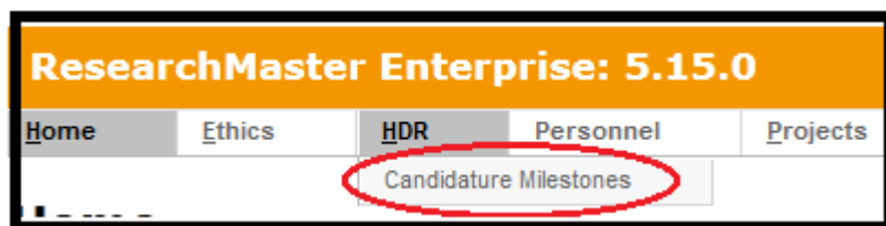
Figure 2 Candidature Milestones menu in HDR module

Click on the HDR module and then click on the Candidature Milestones sub-menu (Figure 3).