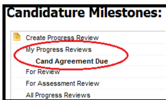
Figure 3 My Progress Reviews

Click on My Progress Reviews (Figure 4).