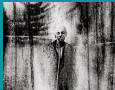
Peter Lyssiotis ... & now? I , 2009 (detail) Giclee print, 108 x 80 cm Deakin University Art Collection, 2013.18. Purchase 2013.