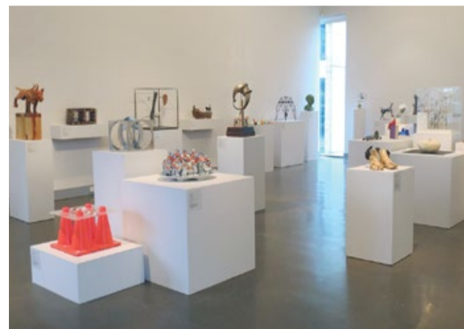
The Deakin University Small Sculpture Award 2016