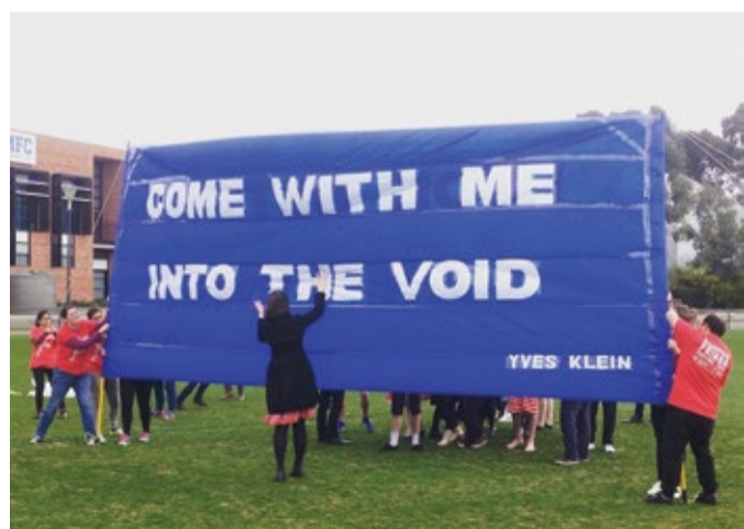
Shane McGrath, Come with me into the void 2015 timber, paper and adhesive tape 400 x 600 cm (approx.)

This exhibition features the work of Melbourne based artist Godwin Bradbeer, one of Australia's most distinguished and celebrated draftsmen. Comprising over twenty large and rarely seen works that include monumental drawings on paper, unique artist books, wall drawings and chalk on blackboard artworks. The exhibition spans across four decades with works sourced from unique private collections with a focus on the fragile nature of Bradbeer's drawing practice and his ongoing subject of the body as a ruin.