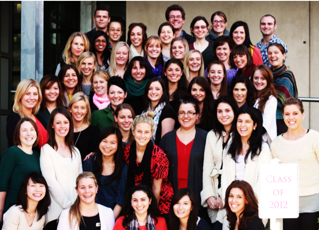
Master of Dietetics class of 2012.

'I would like to see the profession as fundamental to the re-development of products within the food industry, the generation of policies to tackle overweight and obesity and to create strict guidelines in relation to the marketing of food products.'