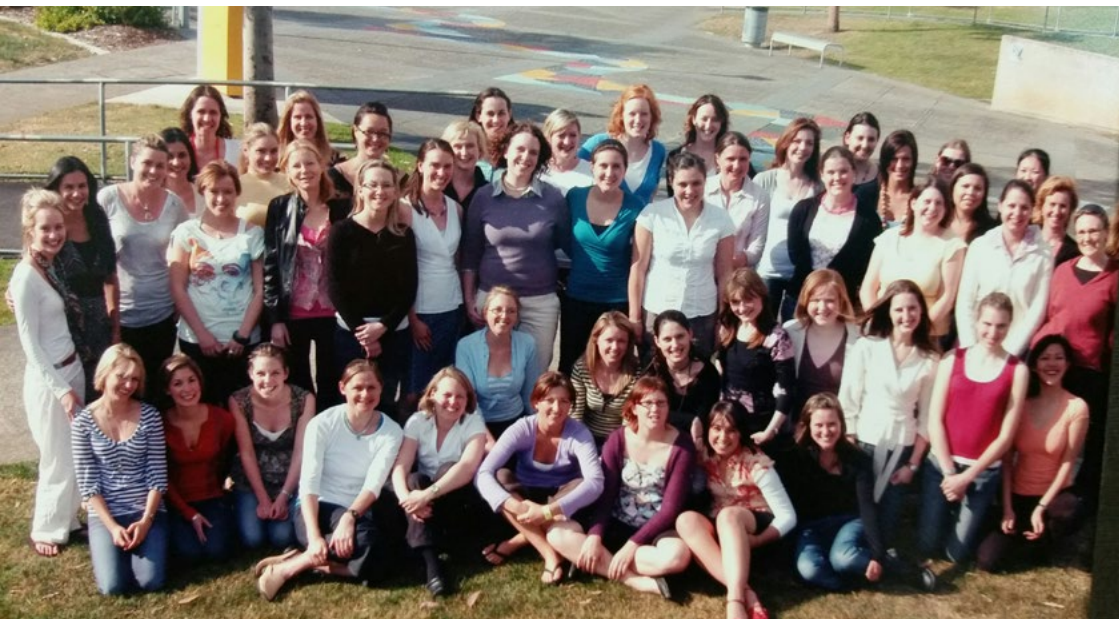
Bachelor of Nutrition and Dietetics class of 2006.

'Most importantly, my research has significantly enhanced my clinical practice as a specialist gastrointestinal dietitian and allowed me to provide best-practice care for my patients.'