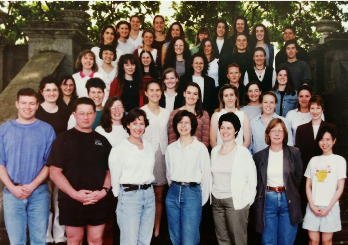
Second year Master of Nutrition and Dietetics students at Stonington Campus, Toorak, 1996.

'I have enjoyed seeing the growth of the profession of Sport Dietetics in Australia, USA and other parts of the world. It is now a full-time profession to many which was not present when I graduated.'