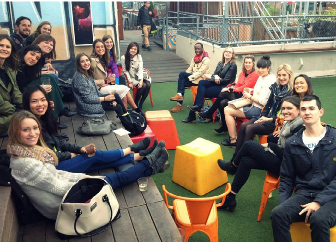
Master of Dietetics class of 2015 end of Semester 1 celebrations, June 2014.

'We need to change our perception from 'food police' to 'clinical experts'. I think it's terribly sad that people avoid seeing dietitians for fear of being told they can't eat their favourite foods.'