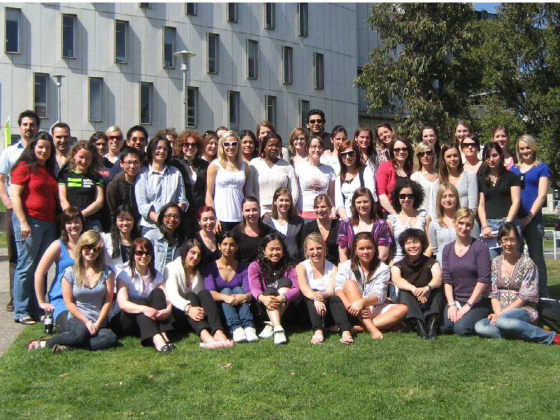
Bachelor of Nutrition and Dietetics, fourth year students and the first cohort of five in the new Master of Dietetics, 2007.

'I want to see strong and proud Aboriginal and Torres Strait Islander people as dietitians, bringing old and new ways together to lead and innovate nutrition solutions in communities across Australia.'