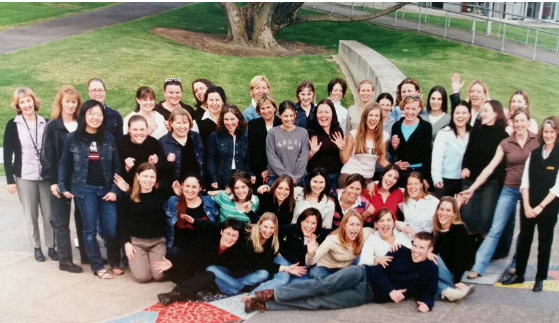
Class of 2003 Bachelor of Nutrition and Dietetics/Bachelor of Applied Science (Health Sciences) students at Melbourne Burwood Campus.

'Dietetics will continue to stay relevant as long as it is driven by a combination of robust research and good quality practitioners that can effectively interpret that research and apply it appropriately in a practical setting.'