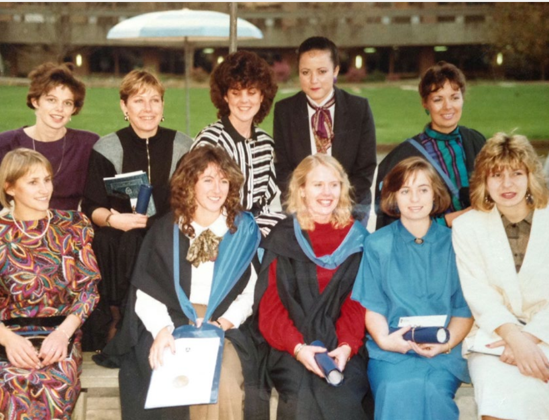
Graduate Diploma of Dietetics class of 1986.

'A solid career in clinical dietetics will stand you in good stead no matter where your career takes you.'