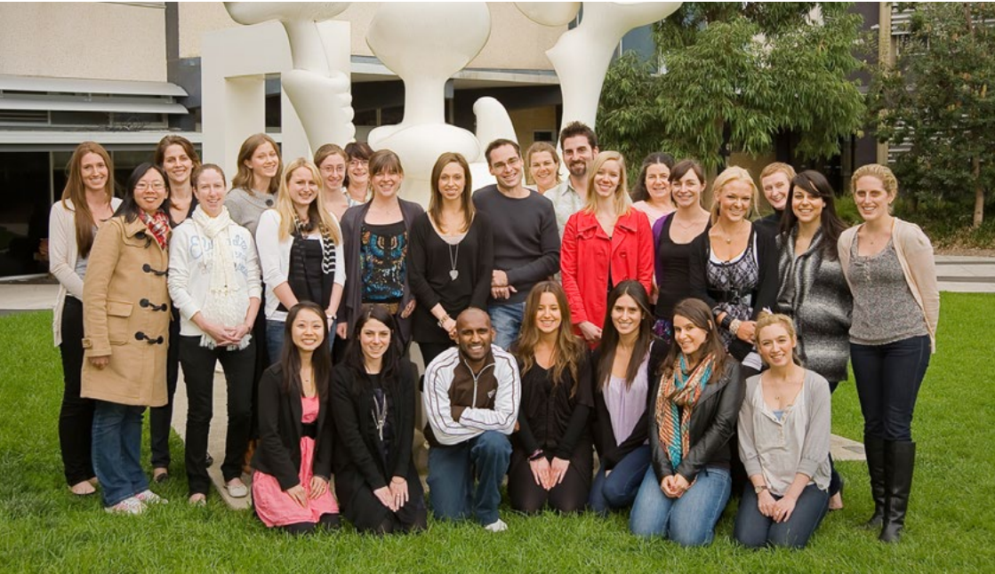
Class of 2010, including the last cohort of the Bachelor of Nutrition and Dietetics students as well as the Master of Dietetics students.

'As the population ages, there will also be ever-increasing demand for dietitians specialising in aged care nutrition. Being able to work with food service staff in aged care facilities to provide appealing and nutritious meals especially for those on texture-modified diets will be important.'