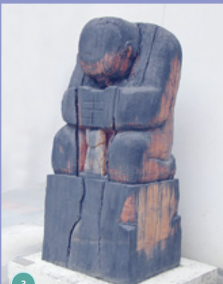
3 LOTUS EATER, 1993 Red Gum Purchase, 1998

BA (Visual Arts Painting) RMIT, 1985; Master of Arts, RMIT, 1995.