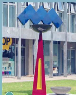
9 DISTILLED KNOWLEDGE, 2000 Painted steel and granite Purchase, 2001

Diploma of Fine Art (Sculpture), RMIT, 1973; Fellowship in Fine Art, Sculpture, RMIT, 1974. Master of Fine Arts (Hons), Columbia University, New York, 1985.