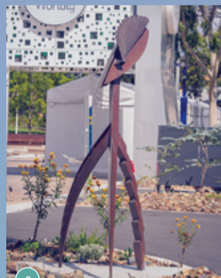
8 MARATHON MAN, 1990 Bronze Purchase, 1998

Diploma of Fine Art (Sculpture), RMIT, 1973; Post Graduate Diploma, Fine Art (Sculpture), RMIT, 1976; Master of Fine Arts (Hons), Columbia University, New York, 1985, Doctorate in Literature, Deakin University, 1990.