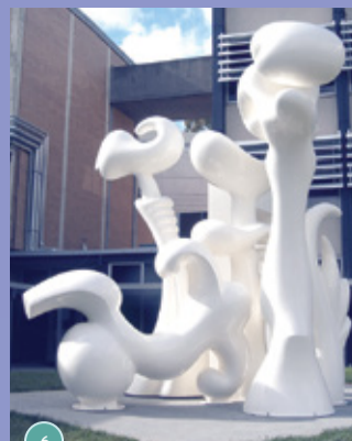
6 COMPILATION, 2003 Steel, fibreglass and epoxy resin, painted white. Purchase, 2007

Diploma of Fine Art, Sculpture, South Australian School of Art, 1968.