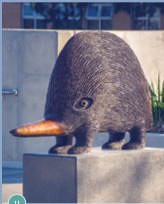
11 ECHIDNA, 2013 Bronze Purchase, 2014