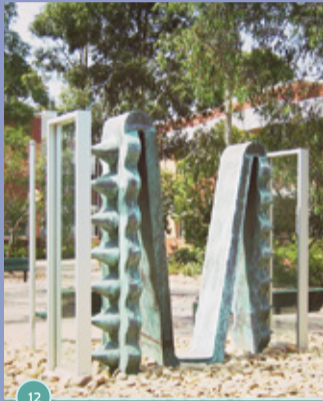
12 FOUNTAIN, 1967 Copper, glass, aluminium set in an area of water-washed river stones, Purchase, 1986

Diploma of Sculpture, 1975, VCA, Post Graduate Diploma in Fine Art, 1977, VCA.