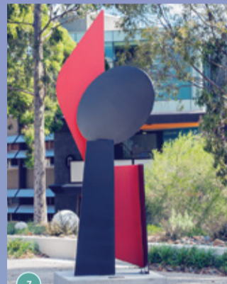
7 GUARDIAN ANGEL, 1995 Polychrome welded steel Purchase, 1997