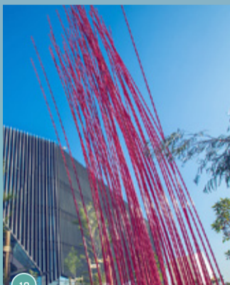
10 RED FIELD, 2014 High performance composites, paint, concrete and steel, Purchase, 2014

Diploma of Fine Art, RMIT, 1976; Master of Arts (printmaking) Monash University, 1993; Ph.D (Printmaking), Monash University, 1999.