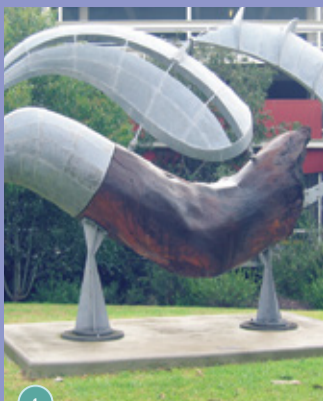
1 SILVER CLOUD, 1995 River Red Gum and galvanized steel Purchase, 1998