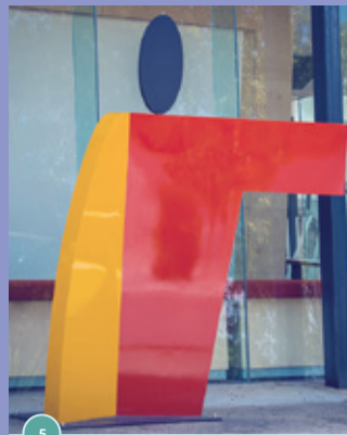
5 LANDSCAPE FIGURE, 2001 Painted welded steel, Purchase, 2008

Certificate of Art and Design, Auckland Institute of Technology, 1997 Bachelor of Fine Arts at VCA 1999, Master of Visual Arts, Monash University, ongoing.