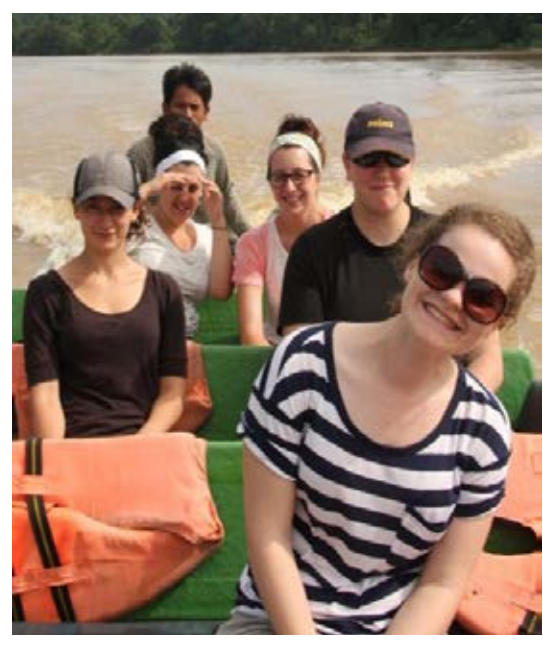
Students participating in the Global Science and Technology Program.

For more information, visit deakin.edu.au/buslaw/mentor.