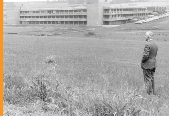
Deakin's Waurin Ponds campus in the 1970s

Established in 1974, Deakin was Victoria's 4th university and the first regional university in Victoria.