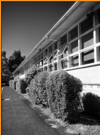
Burwood Teachers College 1970s