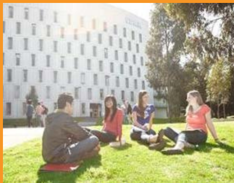
Alfred Deakin Building 2012