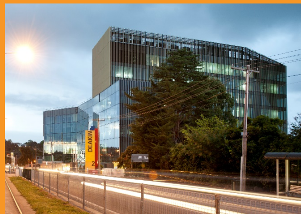
Burwood Highway frontage building 2014