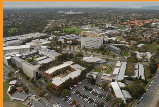
Burwood campus 2007