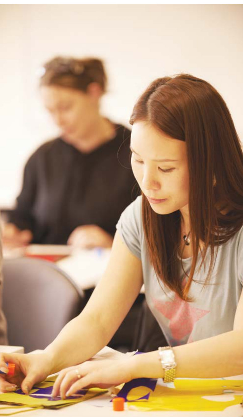
Hands-on learning is a key feature of many Deakin courses.

For more information please visit deakin.edu.au/education .