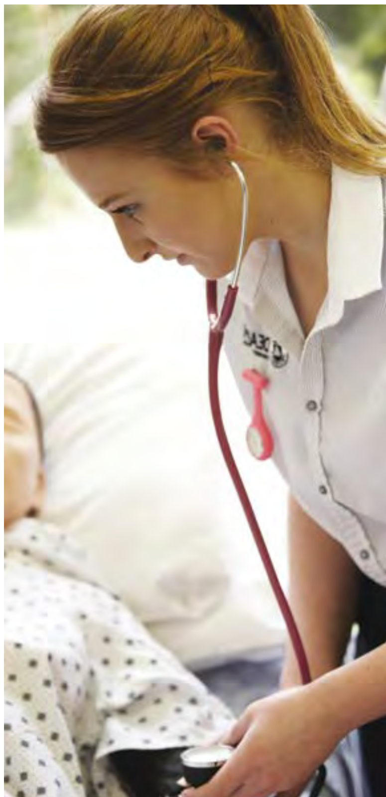
Nursing and midwifery at Deakin has a strong emphasis on hands-on practical experience preparing you for employment in the real world.

One of the great things about Deakin is that we have four campuses throughout Victoria. Many of our courses are offered at more than one campus and the ATAR required for each campus often differs, but the same high-quality degree is delivered no matter which campus you choose. This provides you with more entry options.