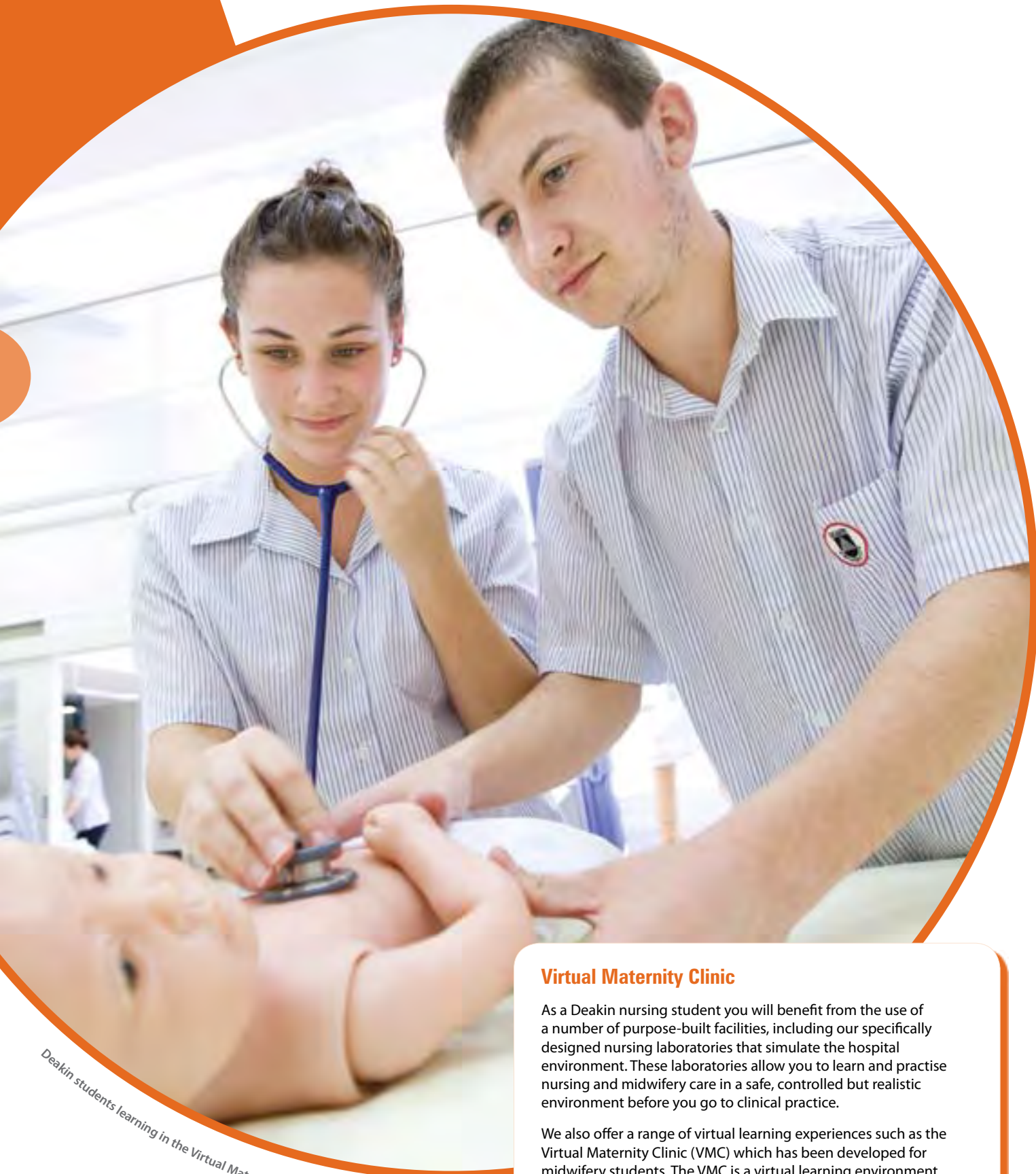
Deakin students learning in the Virtual Maternity Clinic.