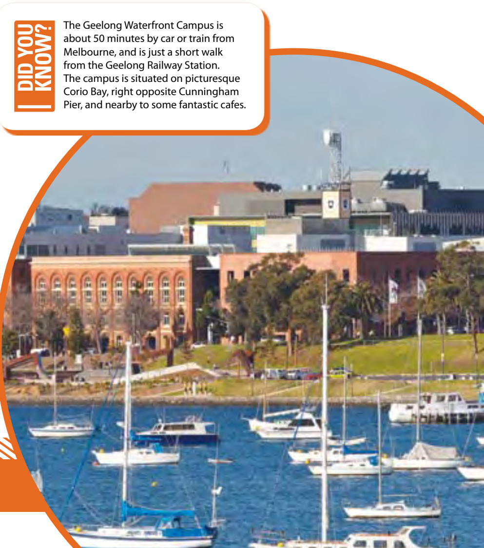
Geelong Waterfront Campus

The Geelong Waterfront Campus is about 50 minutes by car or train from Melbourne, and is just a short walk from the Geelong Railway Station. The campus is situated on picturesque Corio Bay, right opposite Cunningham Pier, and nearby to some fantastic cafes.