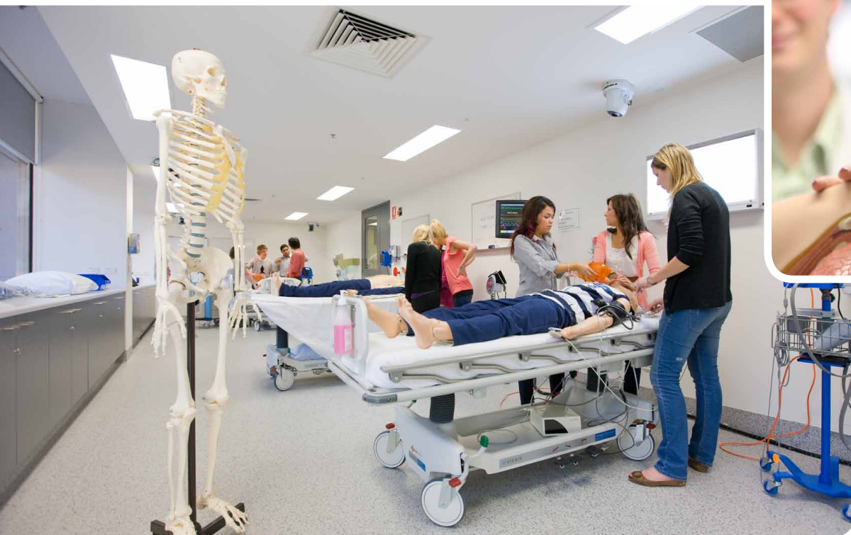
Medicine and optometry information evenings allow students to find out what they will be taught.

6–8.30 pm Lecture Theatre 13 Building hc2.005 Melbourne Burwood Campus