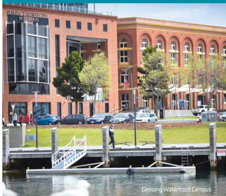
Geelong Waterfront Campus

One of the great things about Deakin is that we have four campuses throughout Victoria. Many of our courses are offered at more than one campus and the ATAR required for each campus often differs, but the same high-quality degree is delivered no matter which campus you study at. This provides you with more entry options and enables you to transfer your studies from one campus to another.