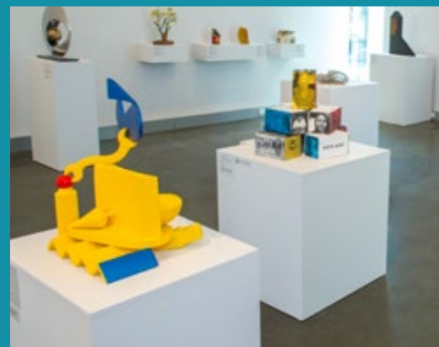
Exhibition of finalists, 2014 Deakin University Contemporary Small Sculpture Award Deakin University Art Gallery

Image: Drawing performance and installation at Western Gallery, Western Washington University Gallery, Bellingham, USA.