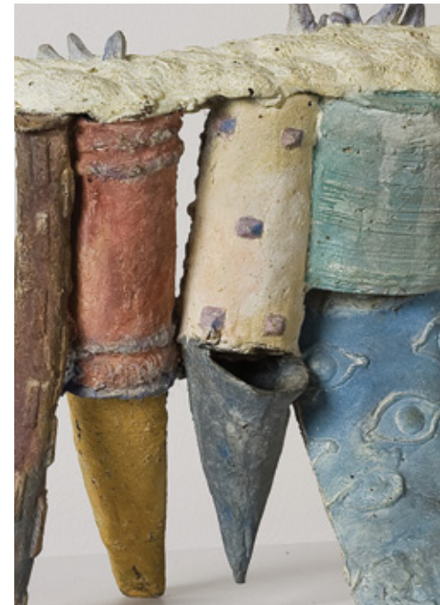
Rodney Broad, Comfort of Archetypes, 8 , (detail) 2010 bronze, 26 x 35 x 15 cm Deakin University Art Collection. Purchase from 2010 Deakin University Contemporary Small Sculpture Award

This exhibition celebrates the acquisition of a major work by renowned artist Jan Senbergs, for the Deakin University Art Collection – Geelong Capriccio (If Geelong were settled instead of Melbourne) 2010. Deakin University Art Gallery will present an exhibition of Senbergs' landscape works that reveal a longstanding preoccupation with Victoria's West Coast including Airey's Inlet, the Great Ocean Road, the Otways and beyond. Like an inventor and navigator, Senbergs combines imaginary conceptions of landscape with the world as it rolls out before his eyes. The result is a curious blend of cartography and observation – a world in which we reside, and simultaneously lives in us.