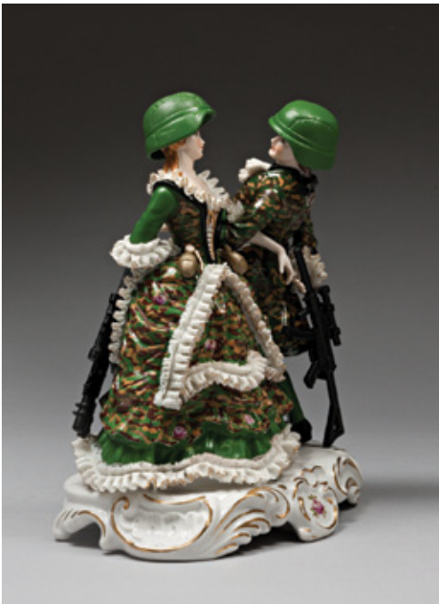
Penny Byrne, War on Terror Waltz 2009 porcelain figurines, vintage Action Man accessories, miniature service medal, retouching medium, powder, pigments. 26 x 21 x 15 cm Deakin University Art Collection, purchase 2010.