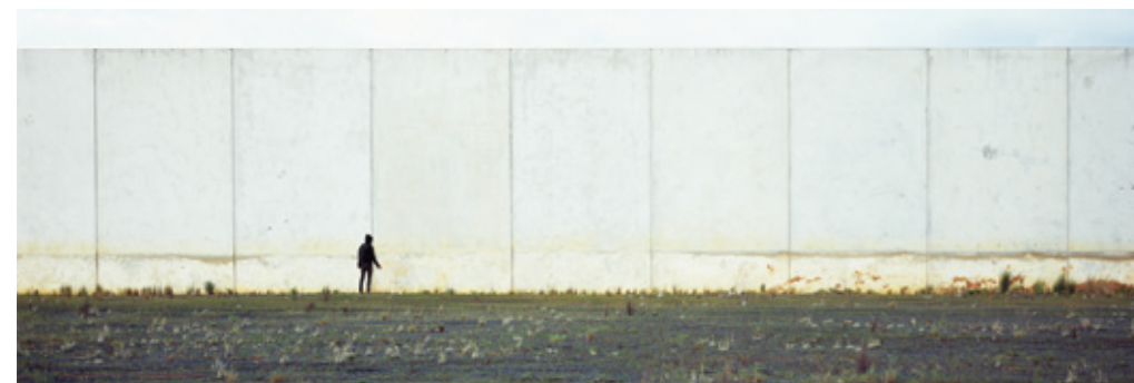
Above: Territory (detail) 2010, David-Ashley Kerr, 127 x 210 cm Image from In Solitude on display from 13 April to 21 May.