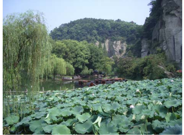
East Lake, Shaoxing, Zhejiang Province

Program 2 is an opportunity to spend a longer period (10-12 weeks) engaging in approved academic studies and teaching practicum.