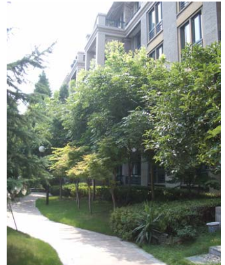
Zhejiang University, Zhejiang Province