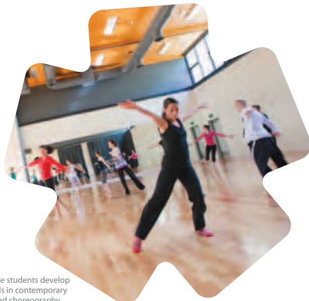
Deakin Dance students develop practical skills in contemporary technique and choreography.

You will gain a range of skills that can be applied to a career in the exciting and creative fields of advertising, commercial design, web design and packaging.