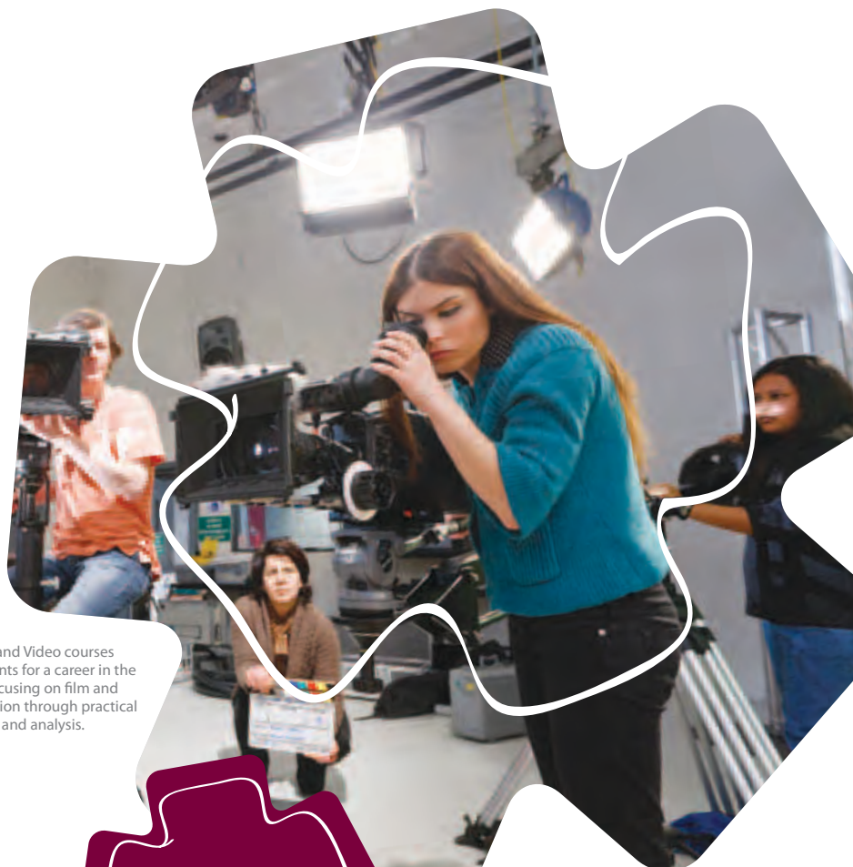
Deakin's Film and Video courses prepare students for a career in the industry by focusing on film and video production through practical work, viewing and analysis.