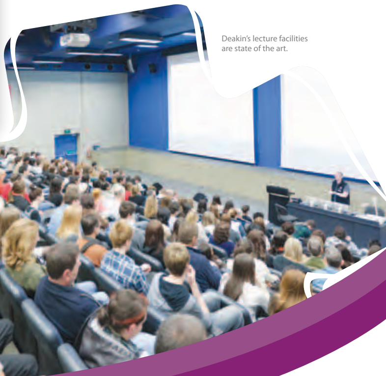
Deakin's lecture facilities are state of the art.

The fees quoted in this book are for Australian students in 2011, and may change for 2012 and later years. You can find more information about fees on our web site www.deakin.edu.au or page 103. For information on fees for international students, please visit www.deakin.edu.au/international .