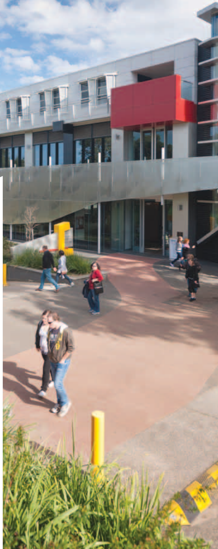
Geelong Campus at Waurnd Ponds

The medical precinct at this campus will be significantly upgraded, with Epworth HealthCare committing to build a 250-bed private hospital by 2013. In addition the recently elected State Liberal Government has committed $85 million for a 32-bed public hospital.