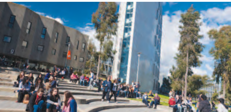
Melbourne Campus at Burwood