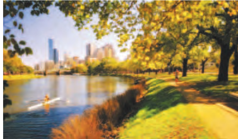
The Yarra River and Melbourne CBD in the background.

Both projects have been funded by the Australian Government's Teaching and Learning Capital Fund.