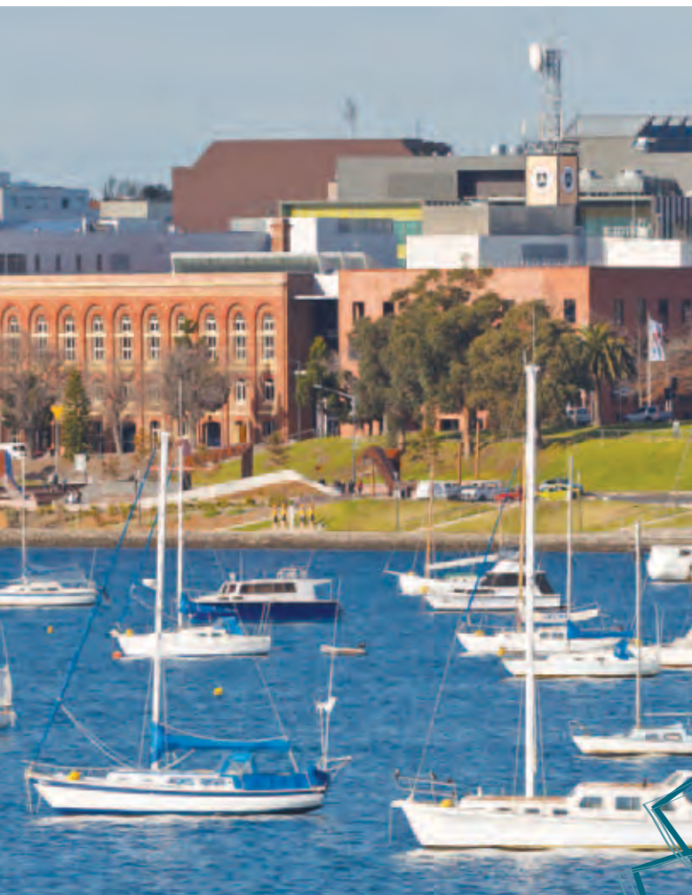
Geelong Waterfront Campus

The extensively refurbished Dennys Lascelles Building houses the Alfred Deakin Prime Ministerial Library and the Alfred Deakin Research Institute. The Alfred Deakin Research Institute is an interdisciplinary teaching and research centre covering political science, public policy and governance, international relations, globalisation, journalism and communications.