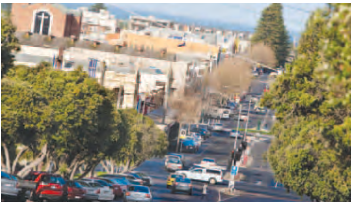
Warrnambool's town centre

The campus is well serviced by a bus which runs between the Warrnambool city centre and the campus. The V/Line train service to Melbourne runs three times a day, with two trains stopping at the campus.