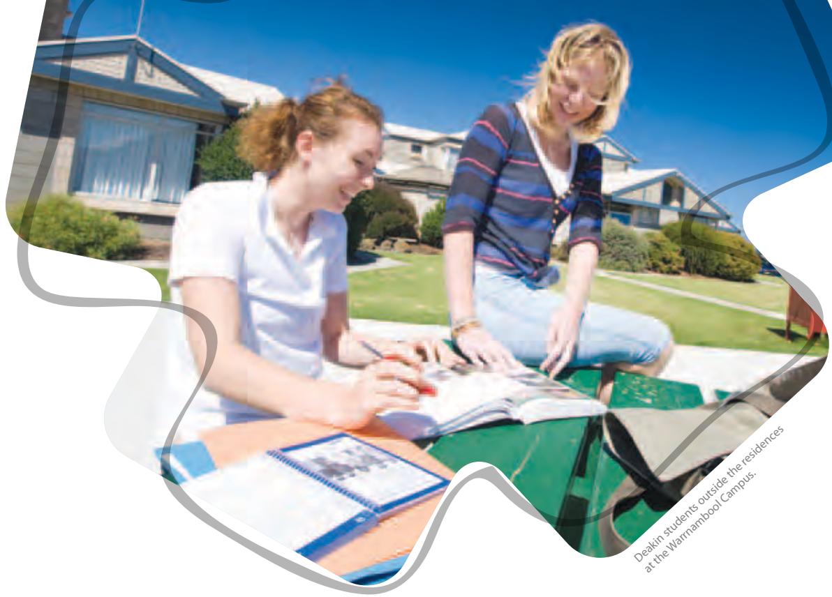
Deakin students outside the residences at the Warrnambool Campus.