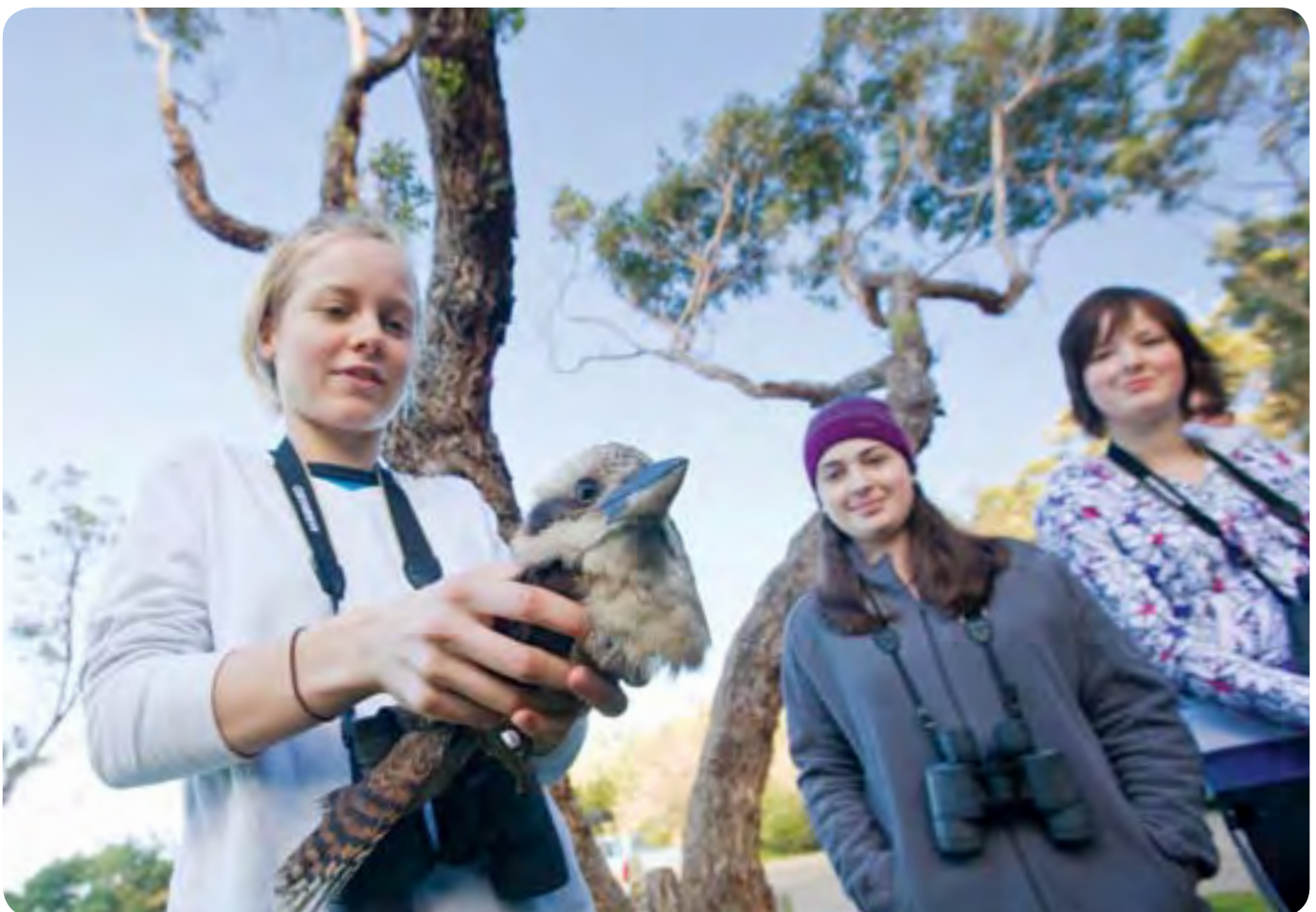
Deakin environment students getting up close and personal with wildlife.

The associate degree can open doors to employment in a range of fields including administration, marketing, business, management, banking, finance, community work, health, natural resource management and science. You also have the option of continuing your studies to complete a bachelors degree which will provide access to a wide range of careers and employment opportunities.