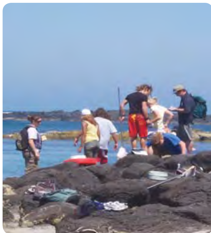
Deakin marine biology students have access to a range of coastal environments right near the Warrnambool Campus.