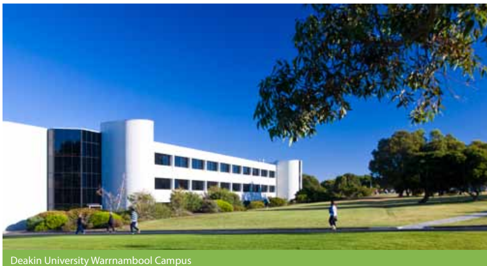
Deakin University Warrnambool Campus