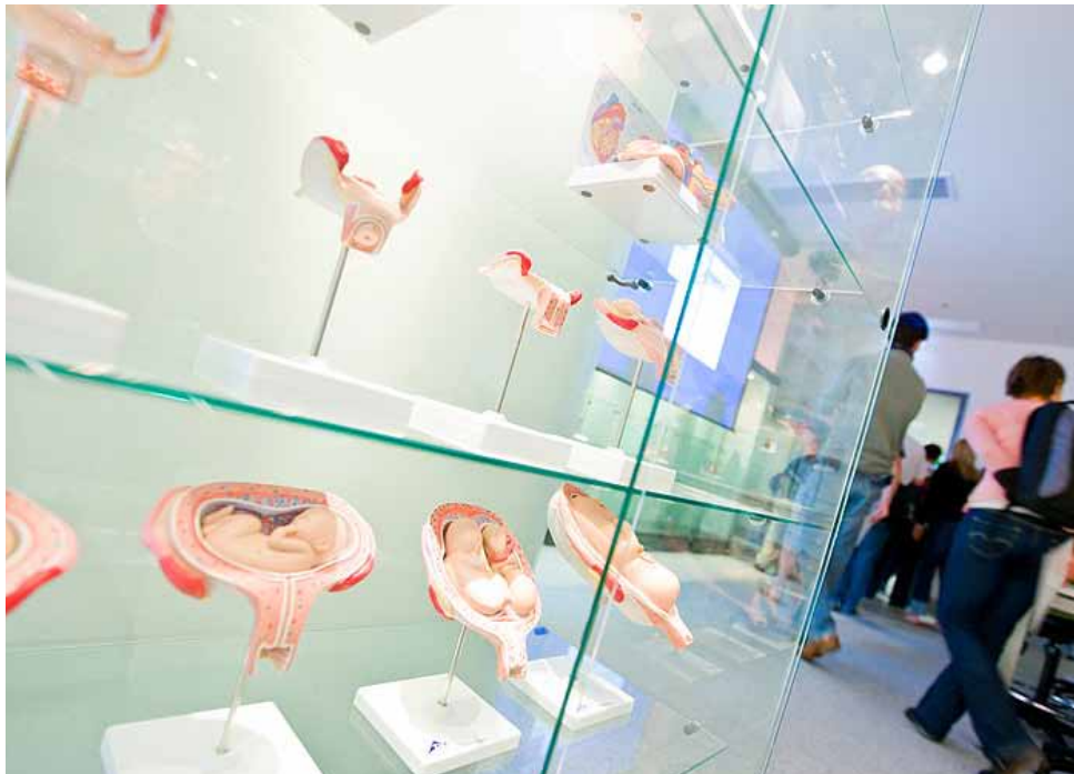
School of Medicine laboratory.

Student and Academic Services. Phone: 03 9251 7777 Email: hmnbs-support@deakin.edu.au www.deakin.edu.au/hmnbs