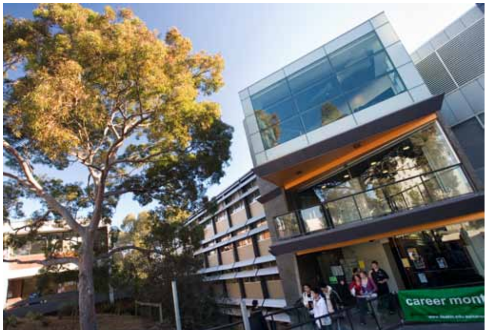
Deakin University Melbourne Campus at Burwood