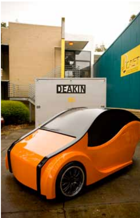
The winning T2 entry.

In a spectacular win against international competitors, Deakin University's answer to the Ford Global Challenge to design a Model-T for the 21st Century was last year chosen as one of two designs showcased by Ford in Detroit last night. The vehicle, designed by a team led by Deakin engineering students, is labelled 'T2' (T-Squared)