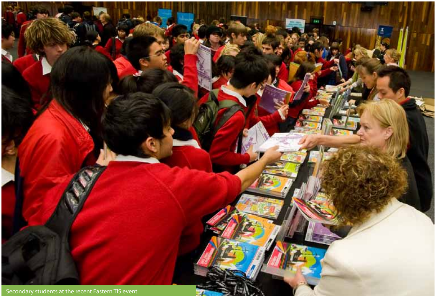
Secondary students at the recent Eastern TIS event

Deakin will be hosting a similar event in Geelong 30–31 July.