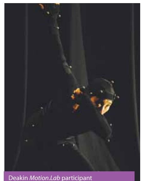
Deakin Motion.Lab participant

For more information, please visit: www.deakin.edu.au/motionlab .