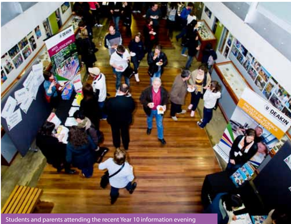
Students and parents attending the recent Year 10 information evening

A new Deakin initiative the 'Your future, your choice' event was held at the Melbourne Campus at Burwood and Geelong Waterfront Campus on Thursday 11 June.