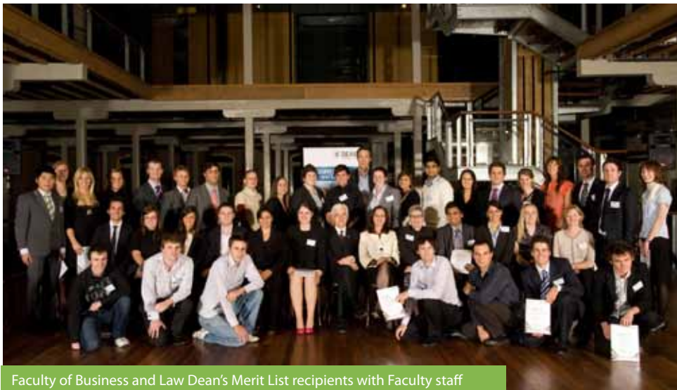
Faculty of Business and Law Dean's Merit List recipients with Faculty staff

For more information on our great range of business and law courses and how your students can take advantage of our combined specialisations please visit: www.deakin.edu.au/buslaw .