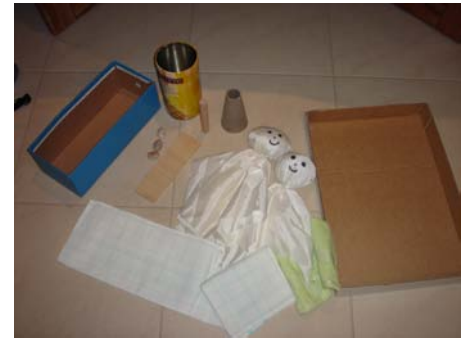
Second set of play assessment toys

Now that all the children are settling into their new primary schools, it will soon be time for the team to go in and meet their prep class teachers and see the children in their new environment. The study includes visits to each of the schools once a term, in the middle of each term so everyone has had a chance to settle in.