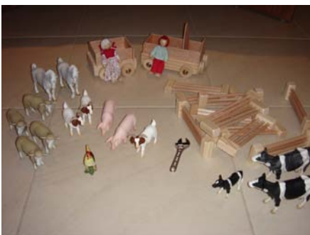
First set of play assessment toys