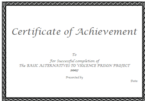
Certificate of Achievement