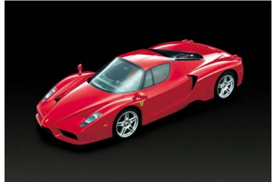
Figure 1. Exotic vehicles such as the Ferrari Enzo feature carbon fibre composite body panels.

Carbon fibre composite automotive body panels have the potential to reduce vehicle mass by as much as two thirds when compared to traditional sheet steel panels. Carbon fibre composites are currently only available on exotic high-performance vehicles due to the large expenses associated with their manufacture and costs required to obtain and retain a Class A painted surface finish. The Quickstep™ process for curing composite laminates allows for substantial time savings over the traditional autoclave process by using a heat transfer fluid, rather than a gas, and also using lower curing pressures.