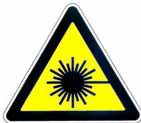
Figure 1. Laser Warning Sign

The Australian Standard recommends signs of type Figure 1 have a base width of 150, 200, 400 or 600mm. Generally the university recommends a Figure 1 type sign have a base width of 200 mm.