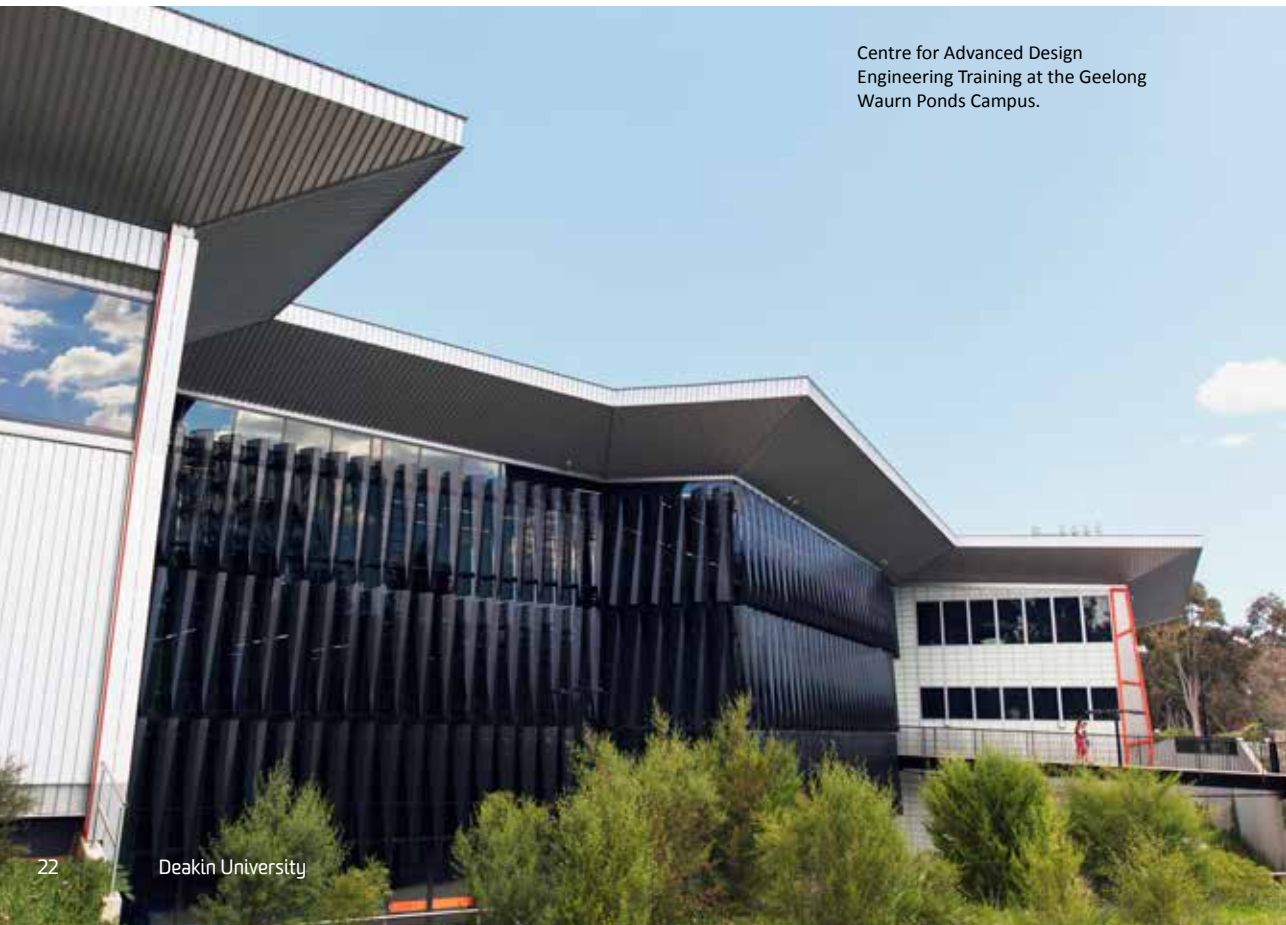
Centre for Advanced Design Engineering Training at the Geelong Waurin Ponds Campus.

The 2018 Excellence in Research for Australia rankings saw Deakin performing at or above world standard in 100% of its research (up from 90% in 2015).