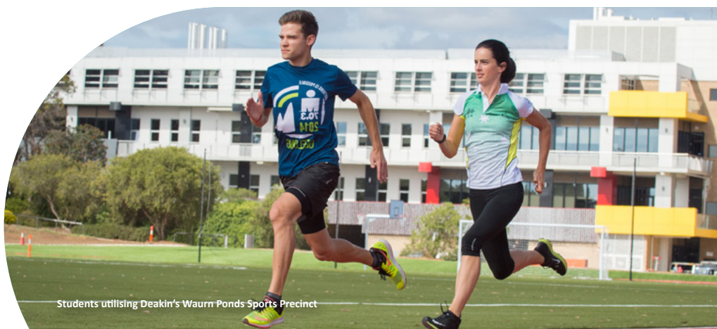
Students utilising Deakin's Waurm Ponds Sports Precinct

Deakin University CRICOS Provider Code: 00113B