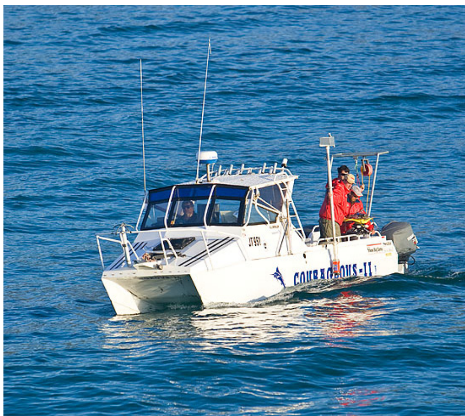
Marine research in Warrnambool.

Visit www.deakin.edu.au/scitech/courses/undergrad/env/fisheries for more information about Deakin's Bachelor of Fisheries and Aquaculture.