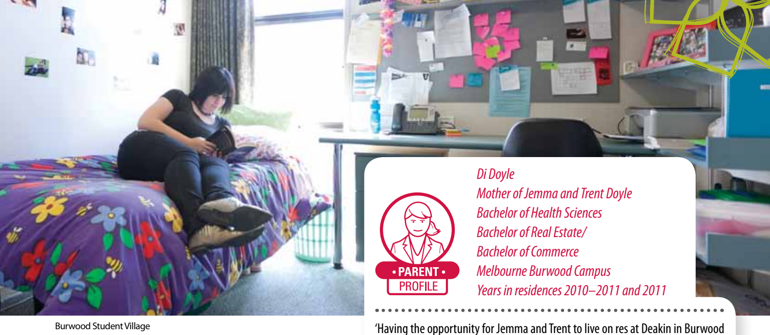
Burwood Student Village

On-campus student housing at Burwood is expanding with the construction of a new building that will house an additional 400 students.