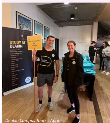
Deakin Campus Tours - April

Deakin Campus Tours Monday 19– Thursday 30 September