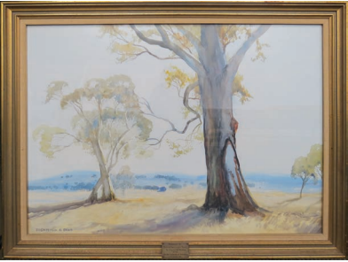
Ronald E Bull, Untitled (View of the Dandenongs) 1976, watercolour on paper, Gift of former staff members of the Gordon Institute of Technology 1985, Deakin University Art Collection, image © and courtesy of the artist's Estate.