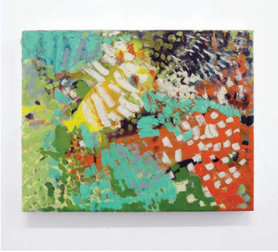
Laura Skerlj, Cloud (I) 2023, oil on linen, image © and courtesy of the artist.