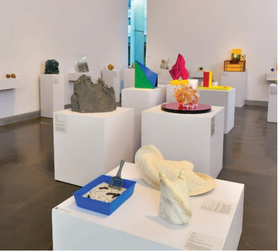
2023 Deakin University Contemporary Small Sculpture Award installation view, Deakin University Art Gallery, August 2023, image © copyright and courtesy of the artists, photo Simon Peter Fox.