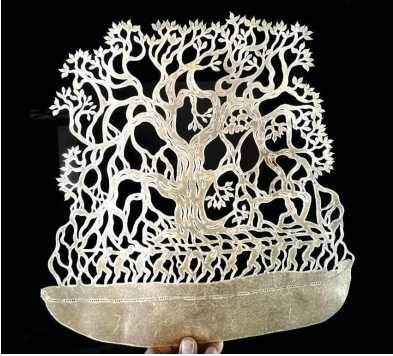
Jumaadi, Boat loaded with trees 2023, buffalo skin, image © and courtesy of the artist and King Street Gallery, Sydney.