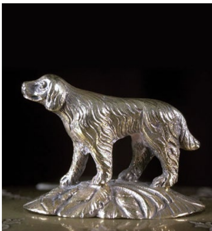
Finial from a tea caddy Inscribed: To S. Deakin on her Silver Wedding Day Oct. 18 1874 Silver plate