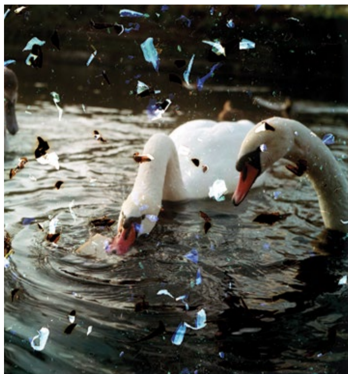
Todd Johnson 3 weeks, 2 days, 4 hours (detail) 2018 digital inkjet print