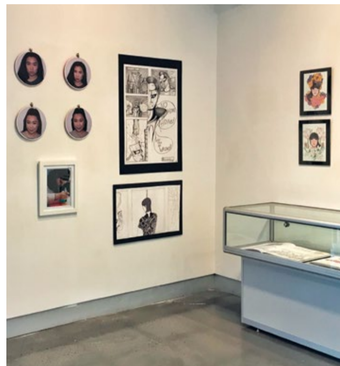
Keysborough Secondary College VCE Art exhibition (detail) 2018