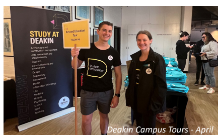
Deakin Campus Tours - April