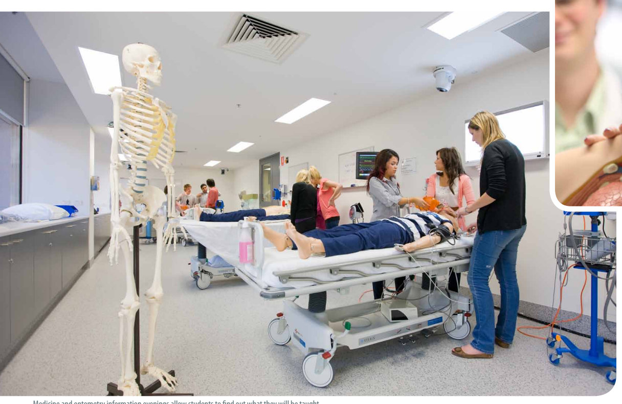
Medicine and optometry information evenings allow students to find out what they will be taught